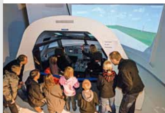
Inside the cockpit

🚌 Tram lines 3, 7, 9 Stop: Markthalle ⌚ Mon–Thu 9 am–4 pm, Fri 9 am–12 noon