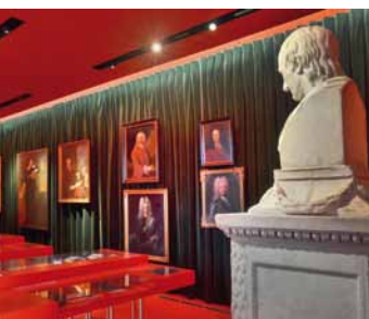
Herrenhausen Palace Museum

🚊 Tram lines 3, 7, 9 Stop: Markthalle/Landtag, 5 min walk 🕒 Tue 10 am–7 pm, Wed–Fri 10 am–5 pm Sat, Sun 10 am–6 pm / Fri: free entry