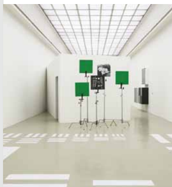
Hito Steyerl 'Digital Conditions'

🚌 Tram lines 3, 7, 9 Stop: Markthalle/Landtag, 5 min walk 🕒 Tue and Thu–Sun 11 am–6 pm Wed 11 am–8 pm/ Fri: free entry