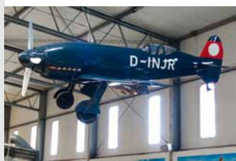
Messerschmitt Me 209

🚌 Commuter rail line (S-Bahn) 5 Terminus Stop Hannover Airport ⌚ Mon–Fri 9 am–6 pm Sat, Sun, public holidays 10 am–7 pm