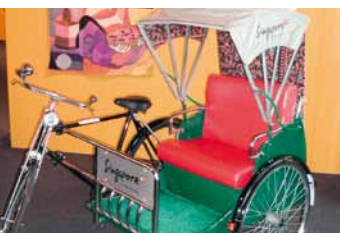
Rickshaws in Singapore

🚌 Tram lines 1, 2, 4, 5, 6, 8, 10, 17 Stop: Aegidientorplatz, 6 min walk 🕒 Fri–Sun 12 noon–5pm