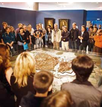
Come and join us