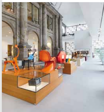
Collection product design

🚌 Tram lines 4, 5, 6, 11 Stop: Steintor 🕒 Tue–Sun and public holidays 11 am–6 pm Thu 11 am–8 pm/ Fri: free entry