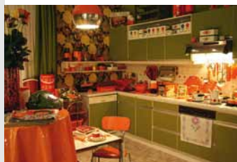
Kitchen from the 1970s

🚌 Tram line 6 Terminus: Messe/Ost (EXPO Plaza) 🕒 Sun 11 am–4 pm