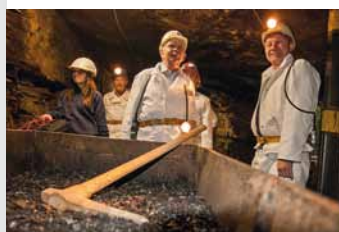
Down the mine

Bus line 300 to Pattensen ZOB bus station, change to bus line 310 to Schloss Marienburg Stop Sat/Sun/public holidays, Apr–Oct