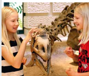
Hands-on dinosaur experience

🚊 Tram lines 4, 5 Stop: Herrenhäuser Gärten 🕒 April–Oct: daily 11 am–6 pm Nov–March: Thu–Sun 11 am–4 pm