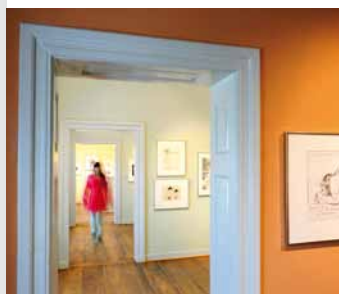
Wilhelm Busch Museum

🚊 Tram lines 1, 2, 4, 5, 6, 8, 11 Stop: Aegidientorplatz / bus line 100 Stop: Maschsee/Sprengel Museum 🕒 Tue–Fri 10 am–5 pm, Sat + Sun 10 am–6 pm