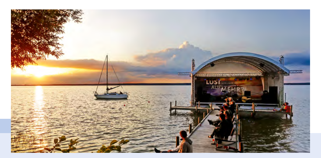
Lake Steinhuder Meer stage