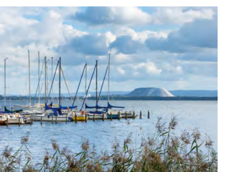
View of the Kalimanjaro from the north bank in Mardorf