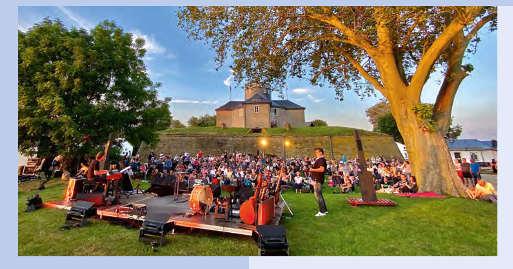
Cultural highlights on Wilhelmstein Island

Every year in August, Steinhude and Mardorf are transformed into a maritime festive site. The Festive Weekend with great fireworks, thousands of illuminated boats on the lake and music on 5 stages charms its guests year after year.