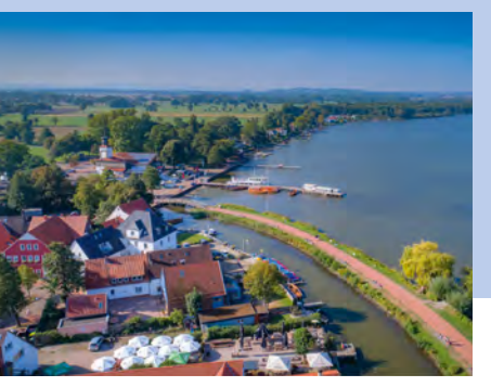
Waterfront in Steinhude

The variety of cultural possibilities and idyllic villages invite you to extraordinary excursions in the surrounding area. Even those who have spent their holidays here for many years, always find new things to discover. Depending on the season, it can be quiet and relaxing or busy and active. We shall show you the most beautiful corners and reasons why Lake Steinhuder Meer is so unique.